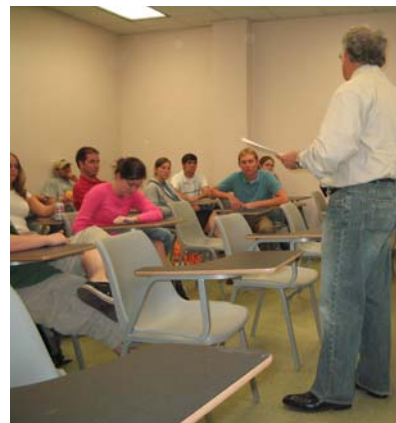
Students at LSU prepare for the Temple Scholarship Challenge.